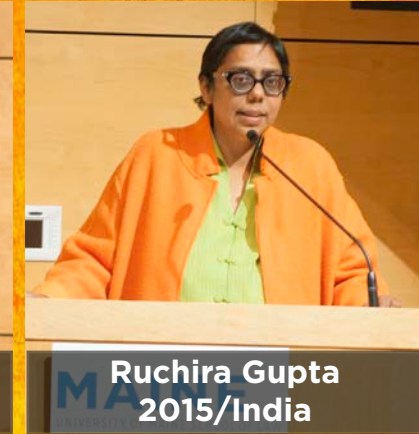
Ruchira Gupta 2015/India