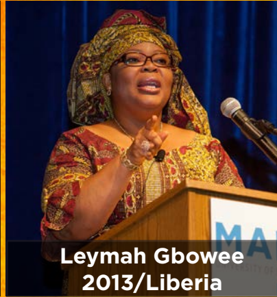
Leymah Gbowee 2013/Liberia