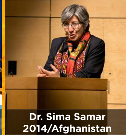
Dr. Sima Samar 2014/Afghanistan