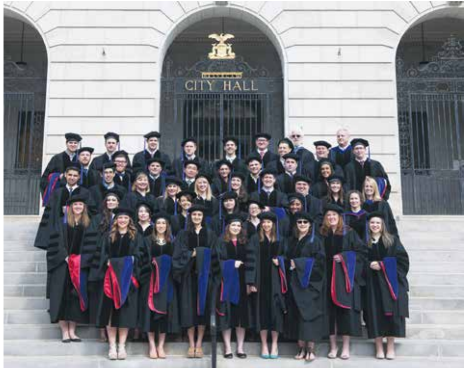
Cumberland Legal Aid Clinic Class of 2015 with the Clinic Faculty.

Students who participated in Clinic last year were exposed to a range of proceedings, where they gained valuable experience and honed their oral and written advocacy and negotiation skills. They appeared as counsel in the following proceedings: 6 interim hearings; 37 Protection from Abuse trials; 139 Protection From Abuse agreements presented to the Court; 64 juvenile proceedings; 8 family law final hearings or trials; 18 mediations; 2 judicial settlement conferences; 30 non-hearing proceedings before Family Law Magistrates; 28 arraignments; 4 change of pleas; 36 criminal dispositional conferences; 1 Law Court brief; 1 Law Court oral argument; 5 sentencing hearings; 3 asylum hearings; 3 Adjustment of Status (Green Card) Interviews; 3 administrative law hearings; and numerous other miscellaneous appearances.