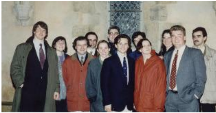
L'Abbaye de l'Épau Le Mans 1995