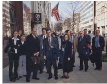
Washington, D.C. 2003