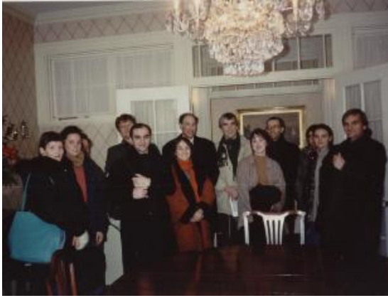
Blaine House Augusta, Maine 1994