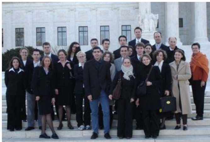
United States Supreme Court Washington, D.C. 2005